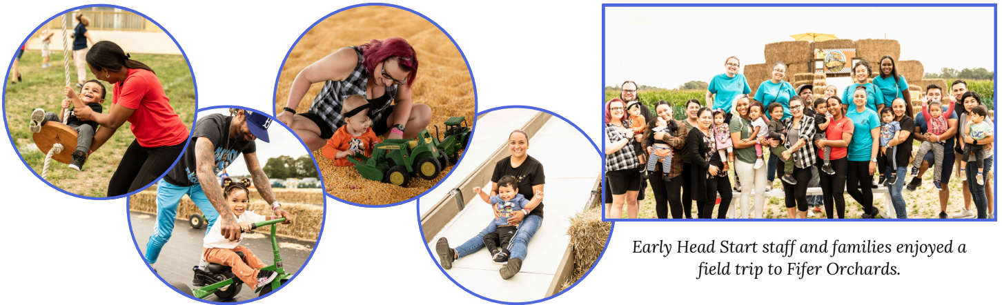
Early Head Start staff and families enjoyed a field trip to Fifer Orchards.